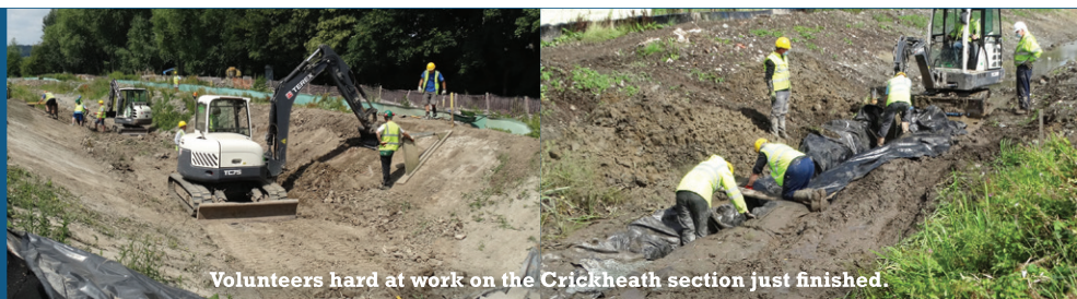
Volunteers hard at work on the Crickheath section just finished.

Your generosity can make a real difference. Without further funds, the volunteers will have to slow or stop. A monthly or annual donation can help forward planning but any gift will be very welcome.